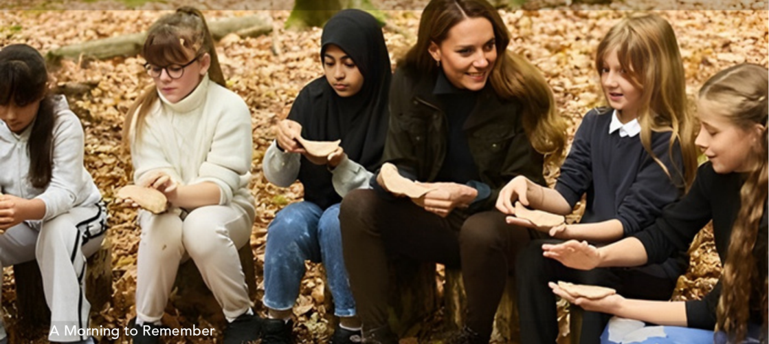
A Morning to Remember

CHILDREN CELEBRATE THE MAGIC OF NATURE WITH HRH THE PRINCESS OF WALES