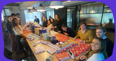
Staff from BGF wrap presents for the Children.

This year our corporate volunteers were also on hand to support Go Beyond. From painting, gardening and decorating at our Centres, to helping wrap more than 1,000 Christmas presents for the children, we are so grateful for their time and enthusiasm. Thank you!