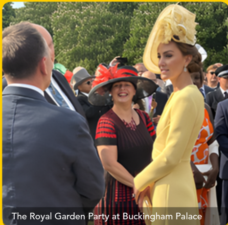
The Royal Garden Party at Buckingham Palace

For Go Beyond, the day was about more than outdoor learning. It was a chance to create magical moments the children will remember: a positive, joyful experience that helps them feel valued.